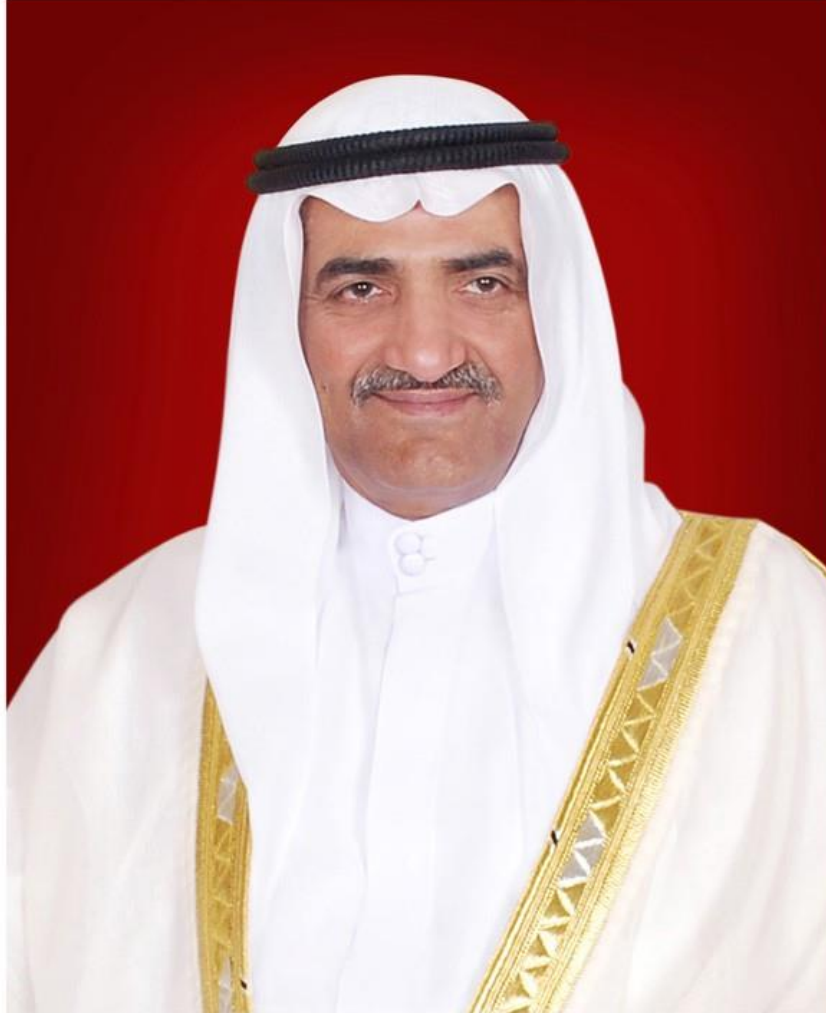
صاحب السمو الشيخ محمد بن محمد الشرفي عضو المجلس الأعلى حاكم الفجيرة