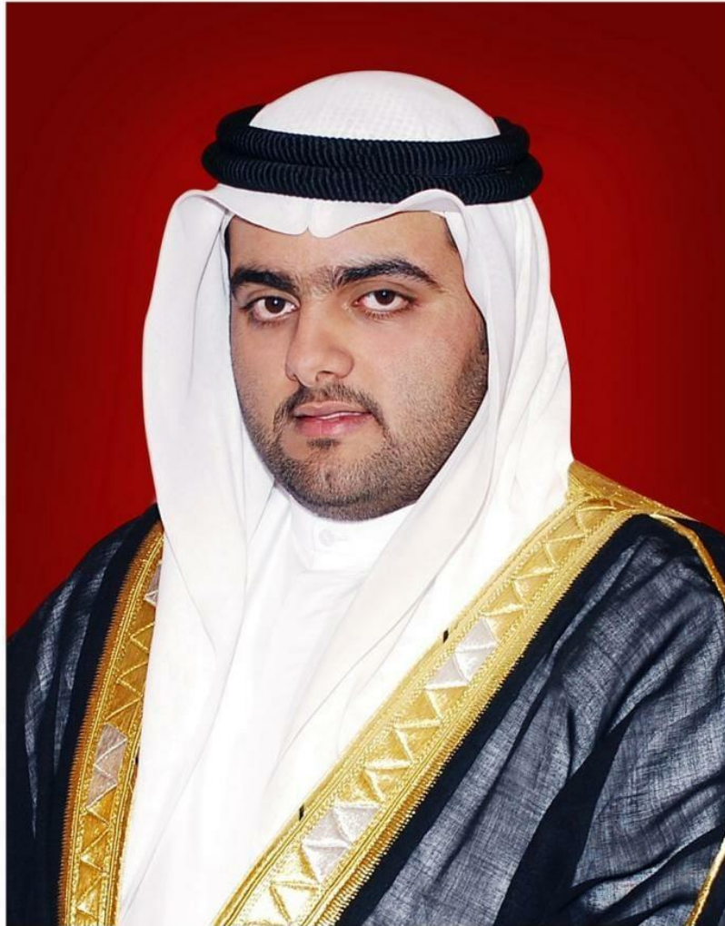
شؤون الشيخ محمد بن محمد بن محمد السرفي ولي عهد إمارة الفجيرة